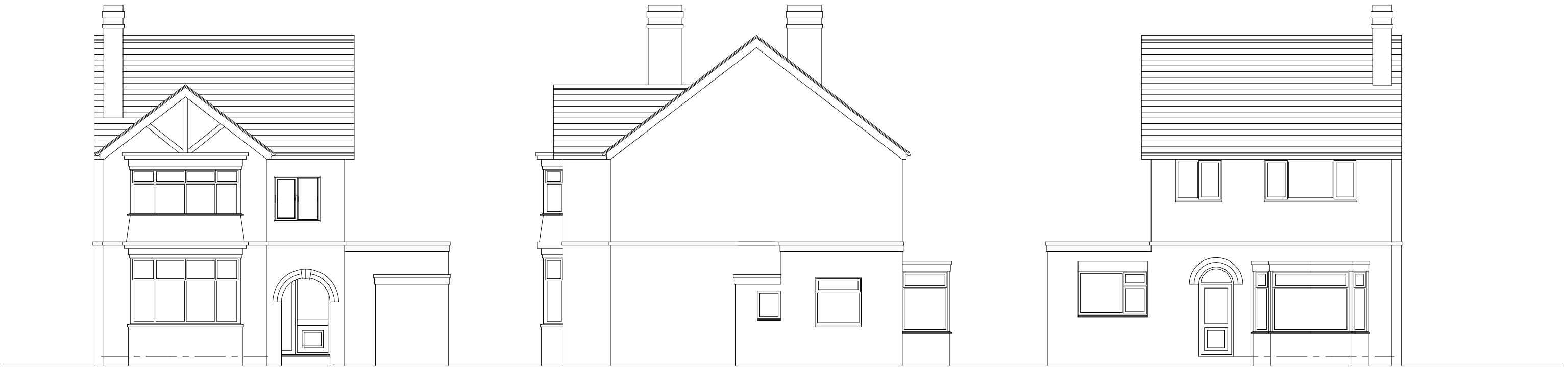
Existing Front Elevation (scale 1:100@A3)